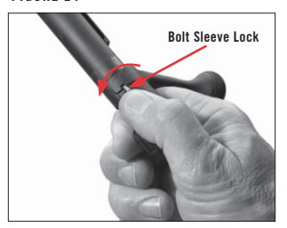
Press the bolt sleeve lock. Unscrew the bolt sleeve.