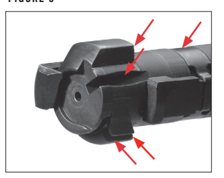
Lubricate the CRF bolt at these locations.

Clean the barrel using a cleaning rod and patch as explained under "Cleaning and Maintenance Suggestions" found in Section 18.1. Apply a few drops of quality oil on the following surfaces: