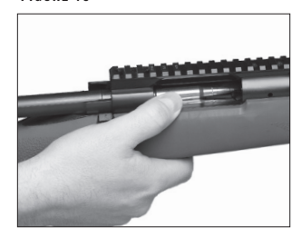
Press the cartridge down until it snaps into place.