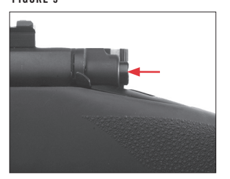
The firing pin indicator (shown cocked).

cartridge is in the chamber and until shooting is imminent.