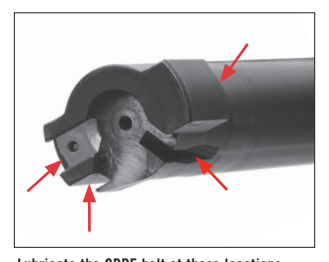
Lubricate the CRPF bolt at these locations