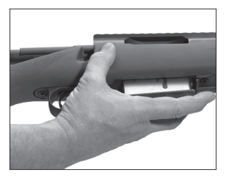
Catch the magazine in your hand.