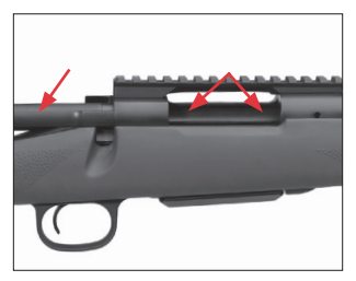
Lubricate at these locations.