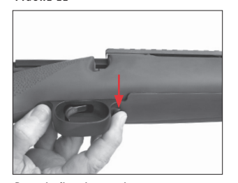
Press the floorplate catch.