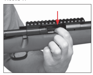
Hold down the top cartridge and close the bolt.