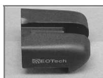
Battery Cap for Model 502, 511, and 551: N Style Batteries Part N1044