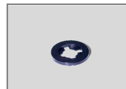
Nylon retaining washer for knurled weaver bolt Part N5252A