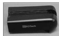
Battery Cap for Model 512 and 552: AA Batteries Part N1045