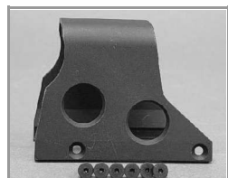
Hood Kit for Models 511, 512, 551, and 552 Part 9-HOOD