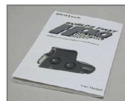
User manual for all models Part N1953