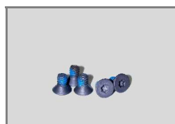
Hood Screws for all models (includes 5) Part N1101C