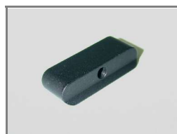
Weaver Locking Bar for all models Part N2020

Terms and Policies: All shipments are FOB Ann Arbor, Michigan. Payment terms are pre-paid via COD, approved Net 30, or VISA/Mastercard. A 1.5% finance charge per month for late payment. Pricing does not include shipping & handling. Pricing is subject to change without notice. 2 year warranty requiring a factory issued Return Authorization number.