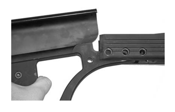
Figures 17 and 18 Removing the Buttstock

5. Removing the Buttstock from the Forestock. Remove the 2 or 3 Buttstock Screws at the right rear of the Forestock using a 5/32 inch Allen wrench. Pull the Buttstock down and to the rear to remove it.