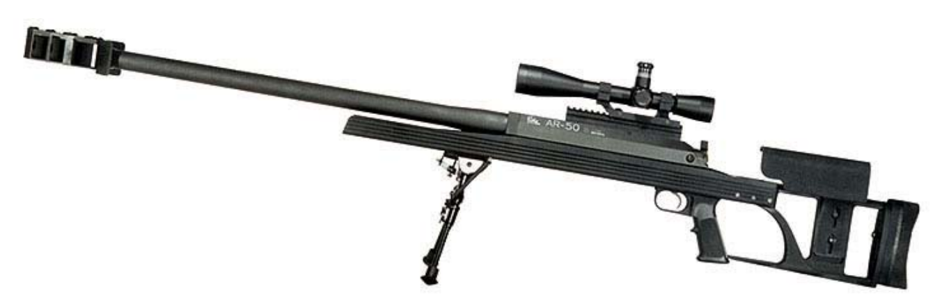
Figure 1, The AR-50 rifle