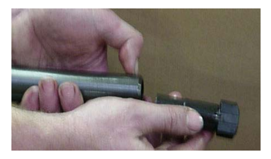
Figure 11, 12 & 13 Removing Bolt Retaining Pin to Remove Bolt Head