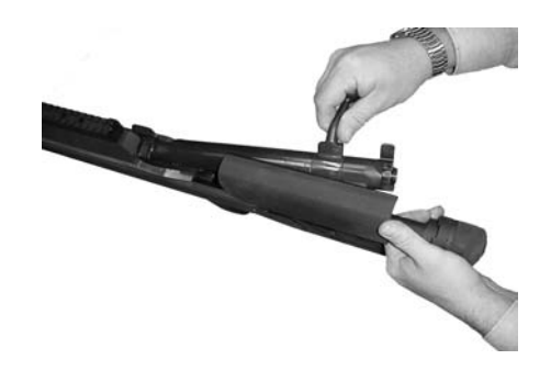
Figures 6 and 7 Removing the Bolt Group

2. Remove the Bolt Group. Use a 3/16 inch Allen wrench to loosen, then remove the button headed Bolt Stop Screw at the left rear of the Receiver. Pull the Bolt Group to the rear and out of the Receiver. Further disassembly of the Bolt Group should be done only for repair or lubrication.