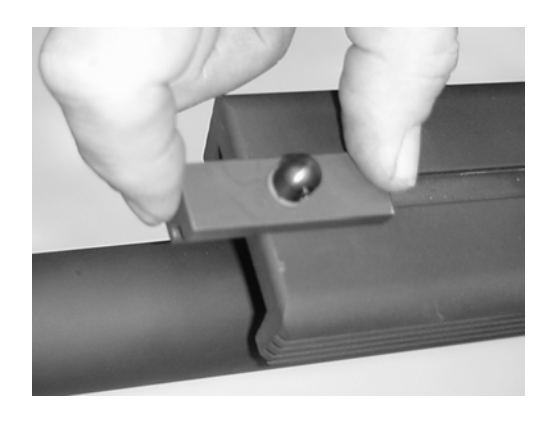
Figures 23 and 24 Installing the Bipod