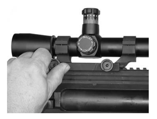
Figure 22 Attaching the ArmaLite Scope Mount

B. Attaching the ArmaLite Scope Mount or Rings: The Scope Mount will accept ArmaLite Mounts or Rings. They are equipped with a positioning cross-rail. Select a location on the Scope Rail, and attach the Scope Mount with the cross-rail engaging a slot in the rail. Tighten the Mount or Rings securely: they are held in place by the grip of the Side Rail.