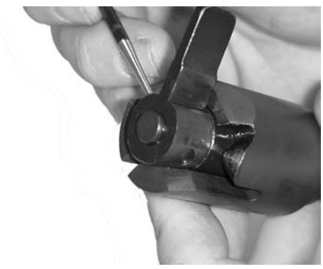
Figure 14 Disassembling the Bolt Sleeve and Striker Group