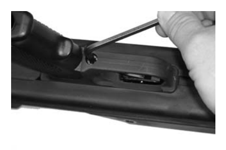
Figure 16 Removing the Grip Frame

Loosen the Bedding Wedge at the front of the Action by loosening the Button Headed Wedge Screw under the action using a 3/16 inch Allen wrench.