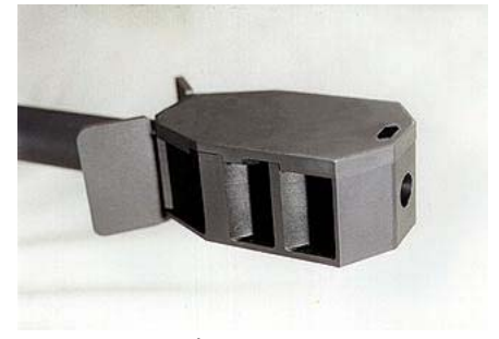
Figure 2 Figure 3 The ArmaLite .50 Caliber Early Muzzle Brake The ArmaLite .50 Caliber Muzzle Break

The AR-50 is equipped with an extremely effective Muzzle Brake. It reduces the punishing recoil of the .50BMG to a relatively mild shove. It is effective enough that even a small-statured shooter can fire the rifle, and most shooters will be able to spend long days at the range without discomfort.