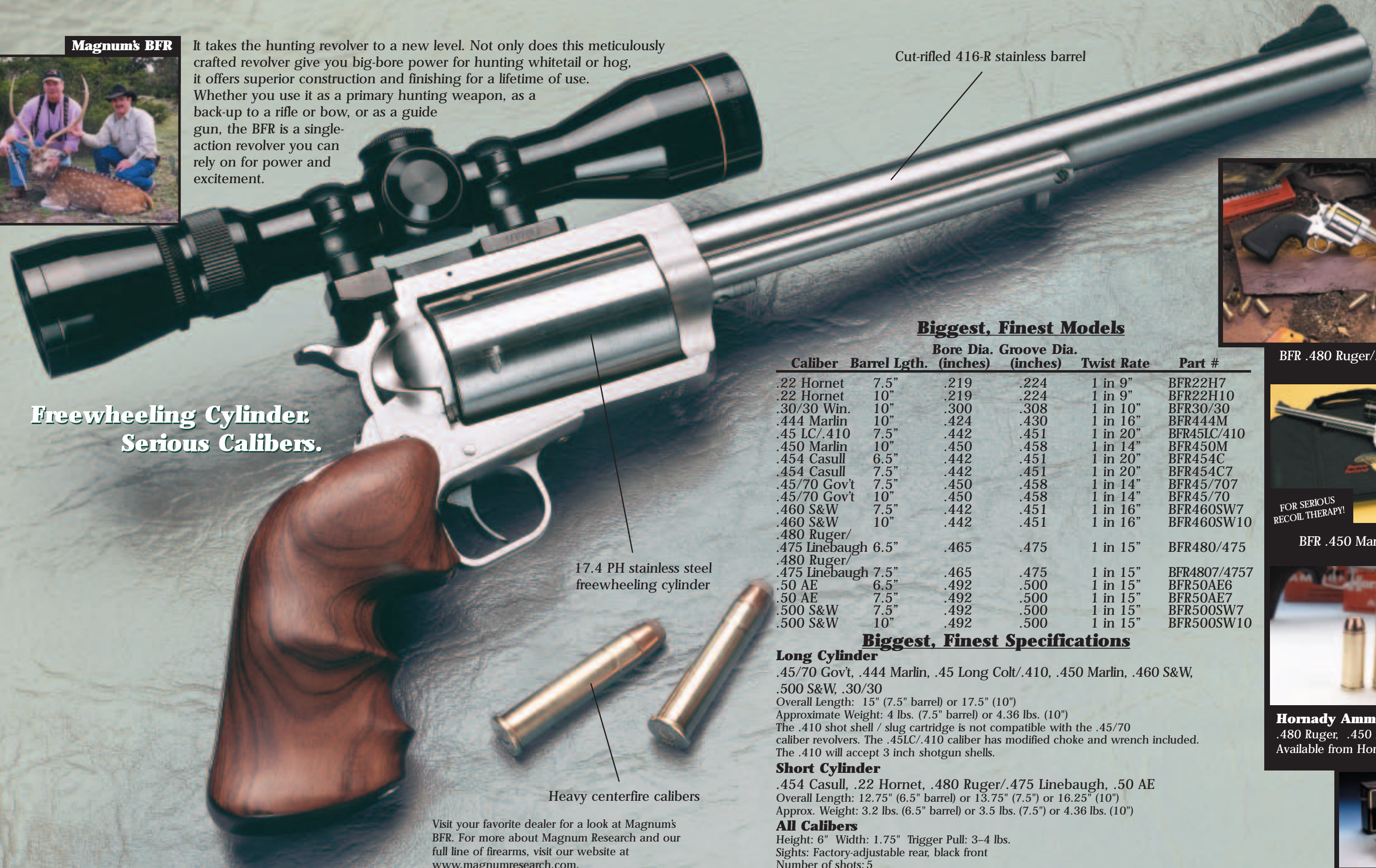
Cut-rifled 416-R stainless barrel

Freewheeling Cylinder: Serious Calibers.