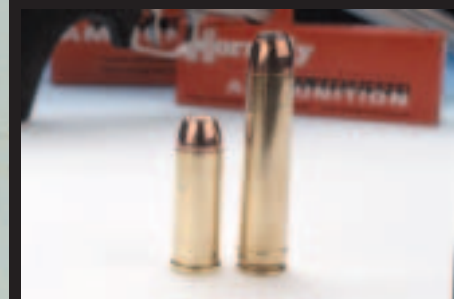
BFR .450 Marlin, 10" barrel

Hornady Ammo .480 Ruger, .450 Marlin Available from Hornady dealers