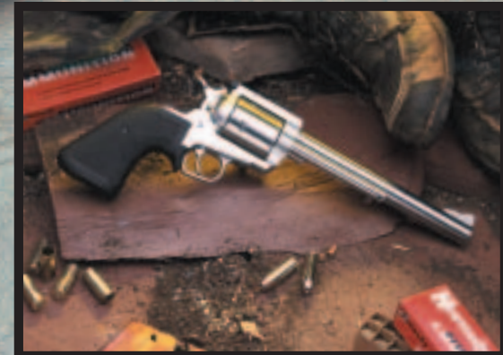
BFR .480 Ruger/.475 Linebaugh

Visit your favorite dealer for a look at Magnum's BFR. For more about Magnum Research and our full line of firearms, visit our website at www.magnumresearch.com .