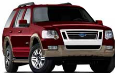
Dark Cherry Metallic