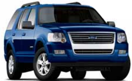
Dark Blue Pearl Metallic