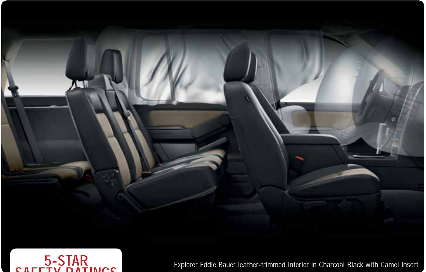
Explorer Eddie Bauer leather-trimmed interior in Charcoal Black with Camel insert