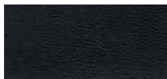
Charcoal Black Leather Standard on Limited