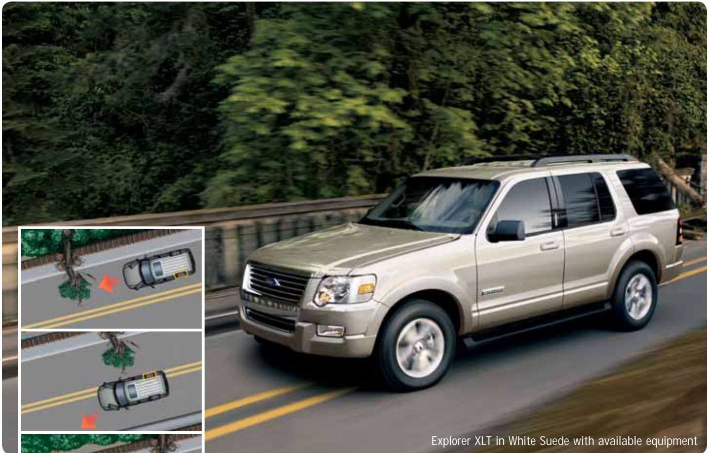
Explorer XLT in White Suede with available equipment