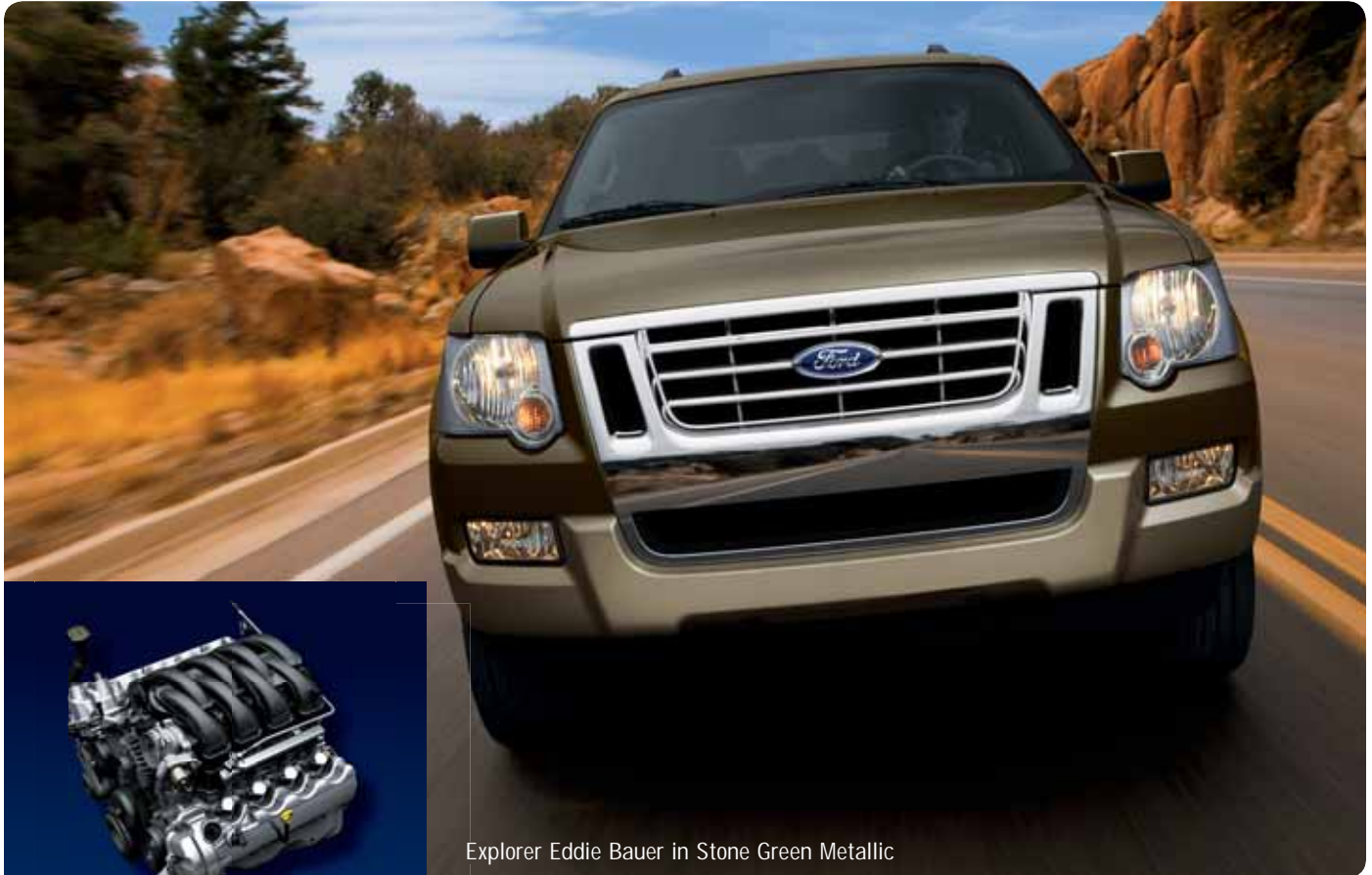
Explorer Eddie Bauer in Stone Green Metallic