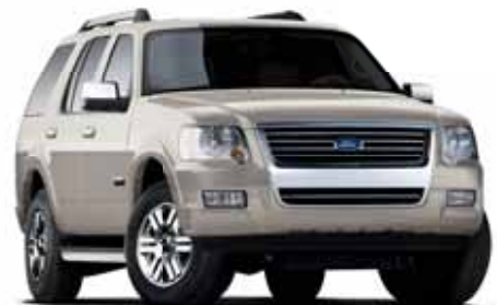
White Sand Tri-Coat Metallic

Ford uses clearcoat paint for beauty and protection. Colors shown are representative only. Not all colors are available on all models. See your dealer for actual paint/trim options. Vehicles shown may contain optional equipment.