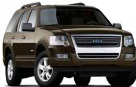
Stone Green Metallic