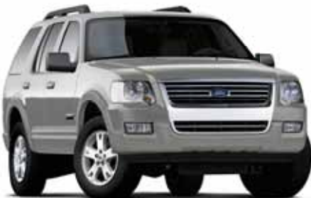
Silver Birch Metallic