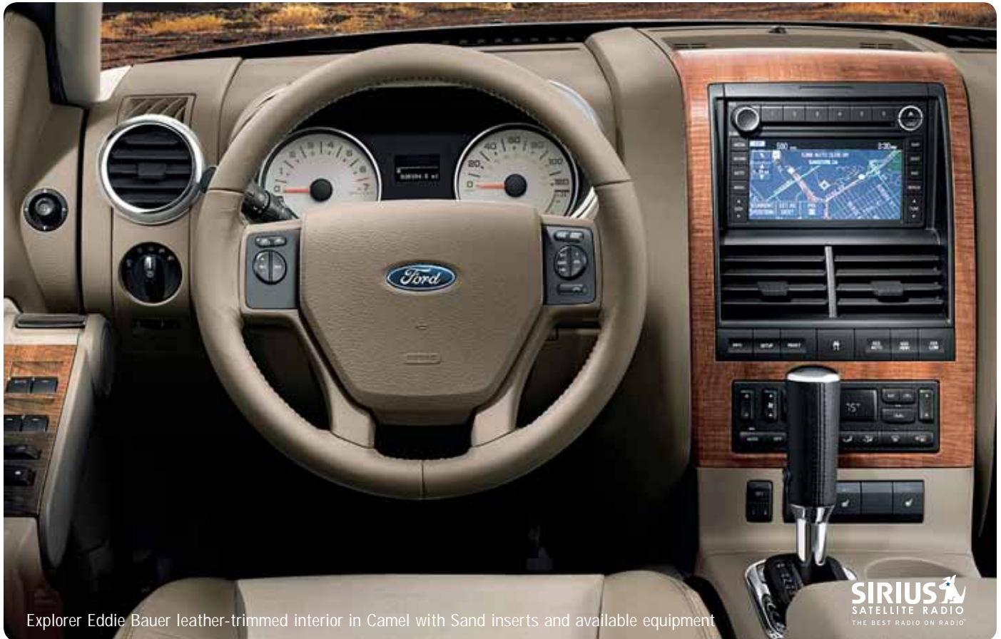
Explorer Eddie Bauer leather-trimmed interior in Camel with Sand inserts and available equipment