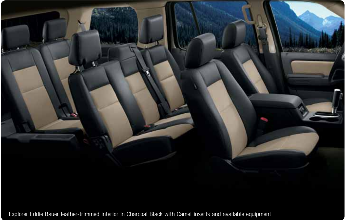
Explorer Eddie Bauer leather-trimmed interior in Charcoal Black with Camel inserts and available equipment