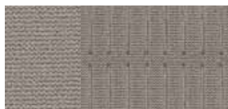
Medium Light Stone Cloth 1 Standard on XLT