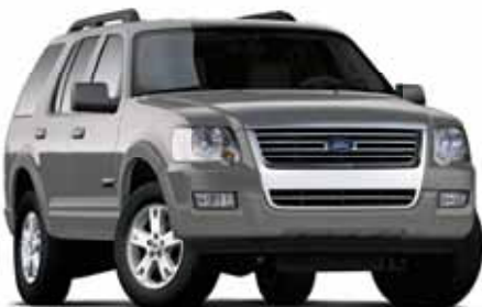
Vapor Silver Metallic