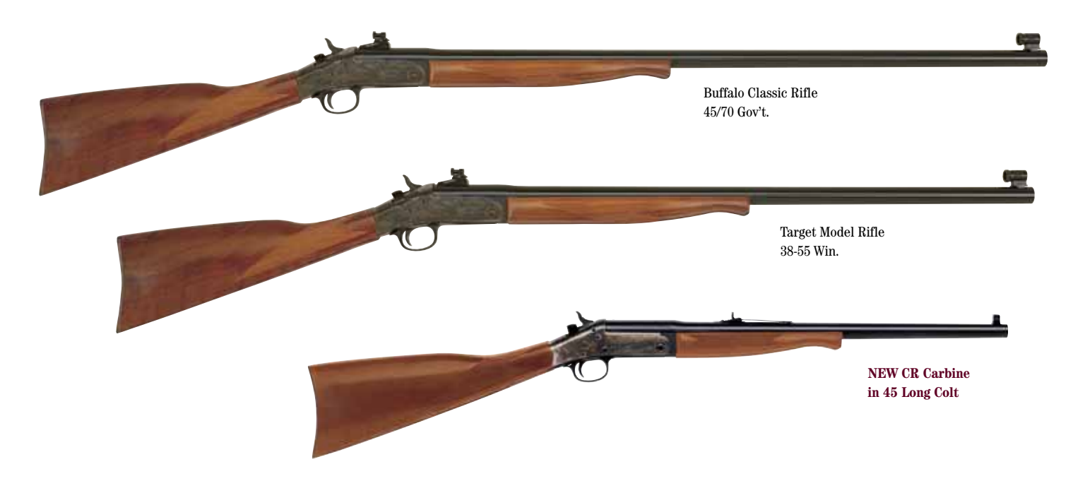
Specifications: All models are single shot, break-open action with side lever release, automatic ejection and transfer bar system. (Subject to change without notice.)