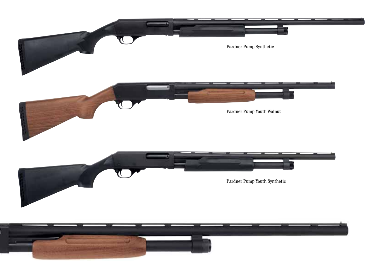
Pardner Pump Walnut