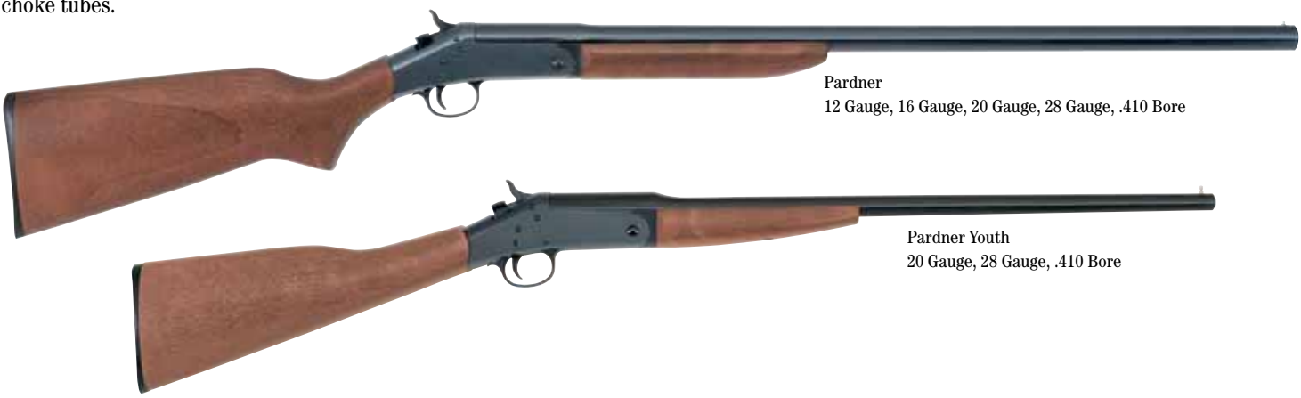
Specifications: All models are single shot, break-open action with side lever release, automatic ejection and transfer bar system. (Subject to change without notice.)

Our tack-driving single shot slug guns can cost less than an accessory slug barrel for your repeater. The Tracker II Slug Gun is available in both 12 and 20 gauge, with a 24" fully-rifled barrel designed for long-range accuracy with sabot-style slugs. The Tracker II features a walnut-finished hardwood stock, adjustable rifle-type sights, a recoil pad and sling swivel studs.