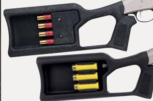
The Tamer .410 buttstock holds four rounds of ammo, and the Tamer 20 holds three.