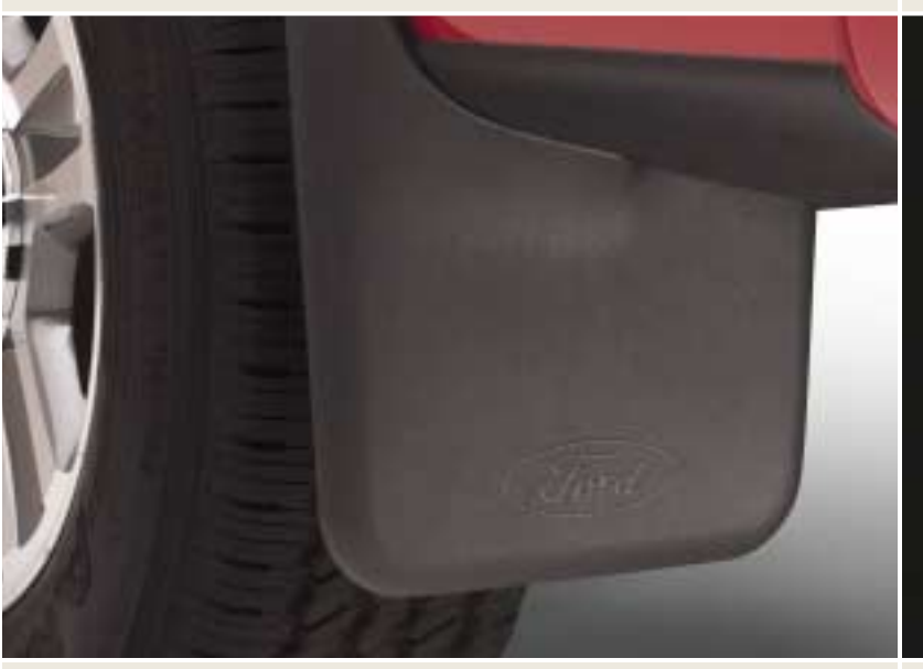
Molded Splash Guards. Our best-selling splash guards protect against mud, snow and ice. You'll find these and other splash guards on page 8.