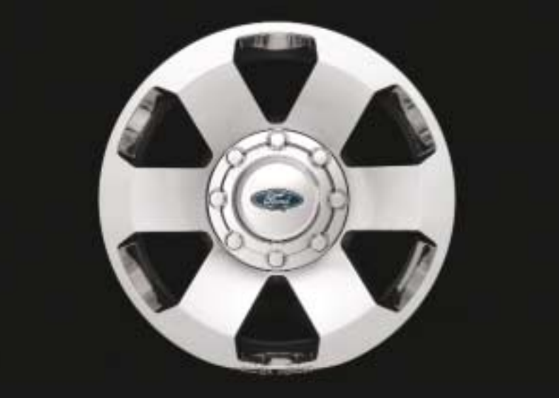
Custom Wheels. These Super Duty wheels rock...and keep you rolling in style. Discover a great selection of custom-designed wheels and caps on pages 10-11.