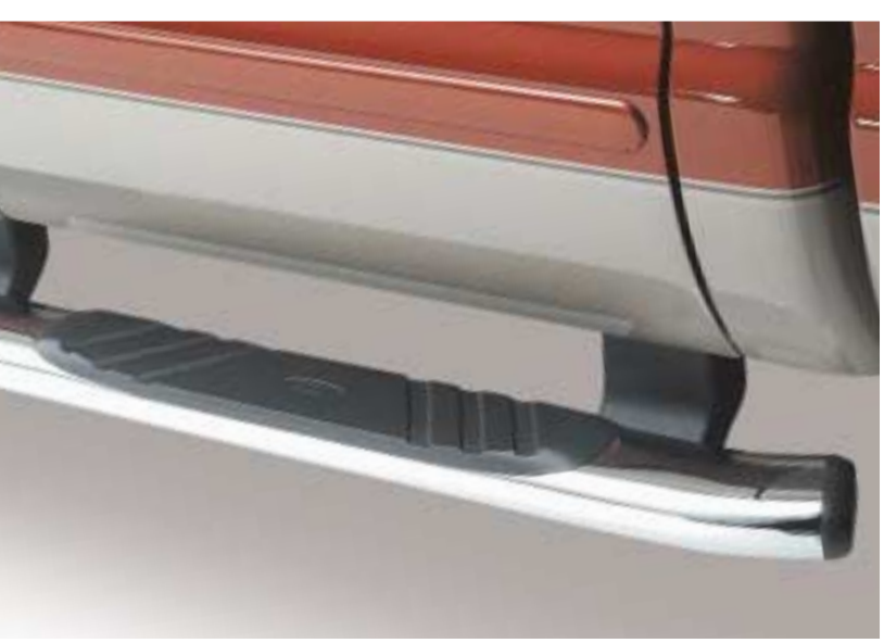
Chromed Step Bars. Make your next step a sure step with these best-selling step bars. See page 5 for the custom chromed step bars and our custom black step bars.

Turn the page and discover a complete catalog of great choices to help you personalize your new Super Duty. Engineered by Ford for a perfect fit and long-wearing durability, Genuine Ford Accessories power up your Super Duty for performance that's hard to beat. Their rugged style and dependability make them the right choice for work sites and just seeing the sights, on city streets or country roads. What's more, you can rely on precise professional installation at your Ford dealer and the backing of one of the industry's strongest limited warranties.