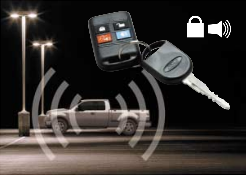
Vehicle Security System. On page 9, we offer products that are designed for your convenience and protection. This popular, state-of-the-art system protects your vehicle and its contents.