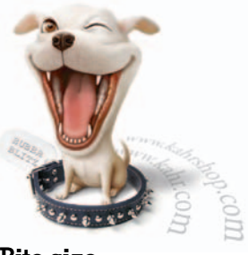
Bite size "BIG BITE"

Six U.S. Patents cover Kahr's unique locking, firing, and extraction systems. The incomparable cocking cam trigger system employs a cam to both unlock the passive safety and complete cocking and releasing of the firing pin. The system provides a "safe cam action"