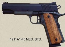
1911A1-45 MED. STD.