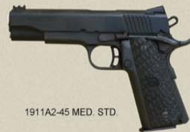
1911A2-45 MED. STD.