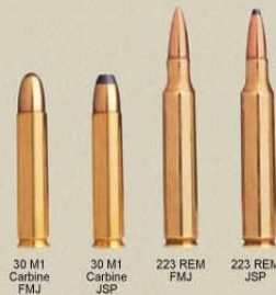
30 M1 Carbine FMJ 30 M1 Carbine JSP 223 REM FMJ 223 REM JSP

These figures are approximate and are shown for reference only. Test barrels were used to determine ballistic figures and results may vary on individual firearms.