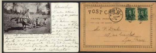
An original 1906 postcard printed by Squires Bingham Co., Inc.