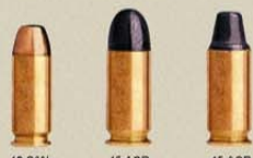
40 S/W FMJ 45 ACP LRN 45 ACP SWC