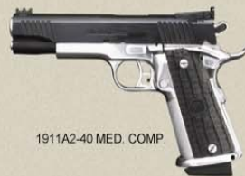
1911A2-40 MED. COMP.