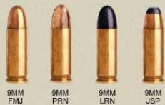
9MM FMJ 9MM PRN 9MM LRN 9MM JSP