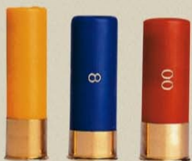
20 Gauge 12 Gauge No. 4 to 8 12 Gauge 00BK/Single Slug