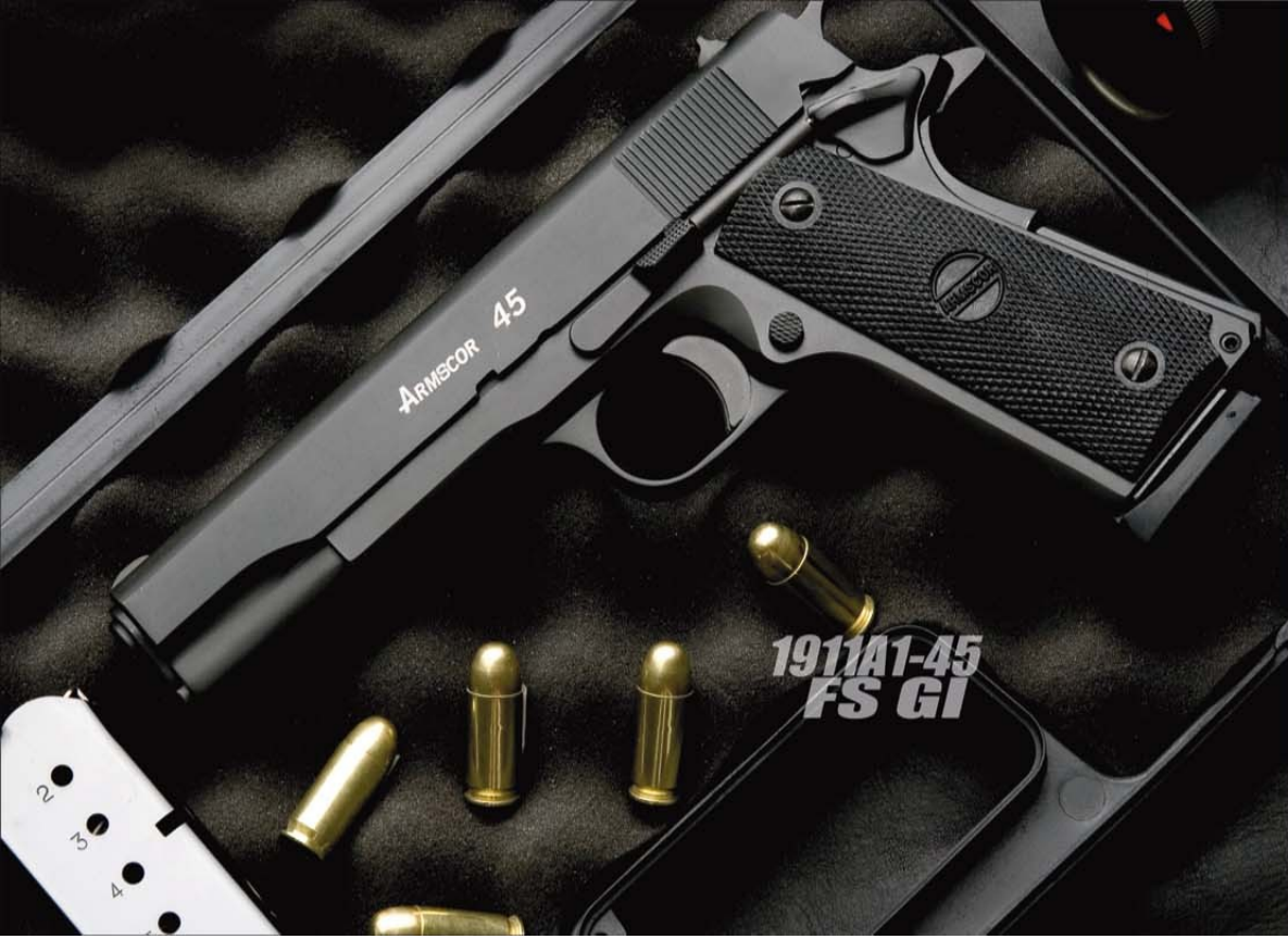
1911A1-45 FS GI