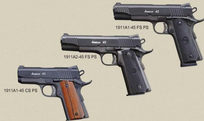
1911A1-45 FS PS