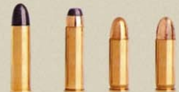
38 SPL LRN 38 SPL JSP 38 Super FMJ 38 Super PRN