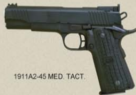
1911A2-45 MED. TACT.