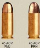
45 ACP FMJ 45 ACP PRN