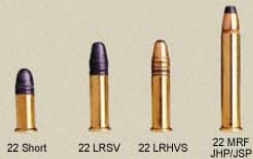
22 Short 22 LRSV 22 LRHVS 22 MRF JHP/JSP