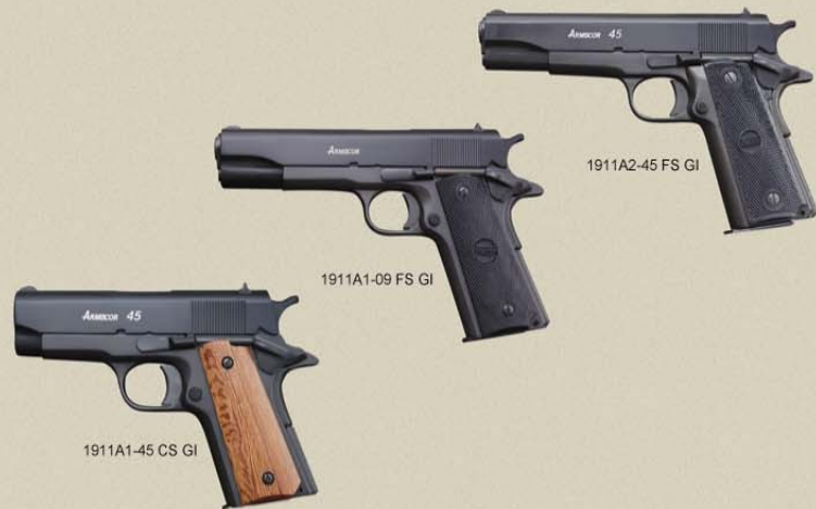
1911A2-45 FS GI