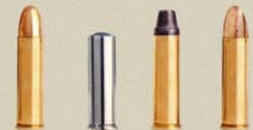
38 SPL FMJ 38 SPL LWC 38 SPL LSWC 38 SPL PRN