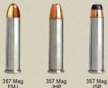
357 Mag FMJ 357 Mag JHP 357 Mag JSP