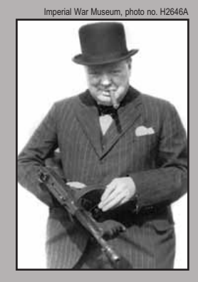
Sir Winston Churchill in the famous 1940 pose with a drum-magazined model of 1928 Thompson. The British were the first to use the Thompson in combat in World War II.

World War II began, and the Army recognized the need for the submachine gun. The Thompson, simplified and more durable with the butt stock removed and a 30 shot stick, became the constant companion of American soldiers. Story, after story, tells how it was the fire of the Thompson submachine gun that protected the villages, saved the troops and won the battles in Europe and the Pacific.