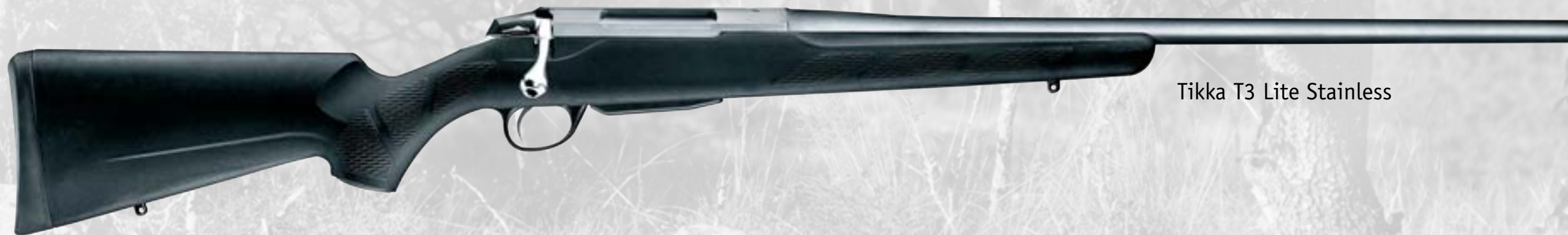
Tikka T3 Lite Stainless

The Tikka T3 Lite has all black stock with blued cold-hammer forged free-floating barrel. The light but sturdy T3 TrueBody glass fiber reinforced polymer stock is pure Sako innovation. The straight stock combines high performance and light weight. Positive checkering for comfort and firm grip in all conditions. Improve your marksmanship with this stealthy T3 challenger.