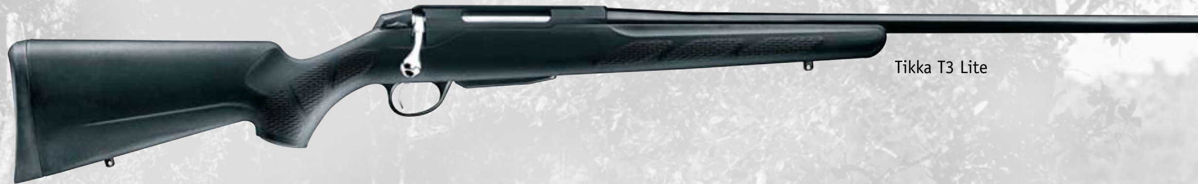
Tikka T3 Lite