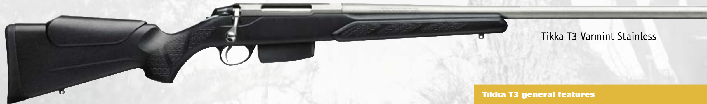
Tikka T3 Varmint Stainless

When it comes to consistent, predictable accuracy, be it at the range or the plains, the Tikka T3 Varmint is hard to out-shoot. The heavy, free-floating precision barrel effectively eliminates vibration and will not overheat even in fast-paced varmint shooting. The receiver and barrel are made of high grade blued Cr-Mo steel. The synthetic stock has an extra-wide fore-end for bench resting and the swivel stud accommodates both a bipod or a sling. Just install an add-on cheek piece for proper head position with large scope - and you are geared up for some serious fun.