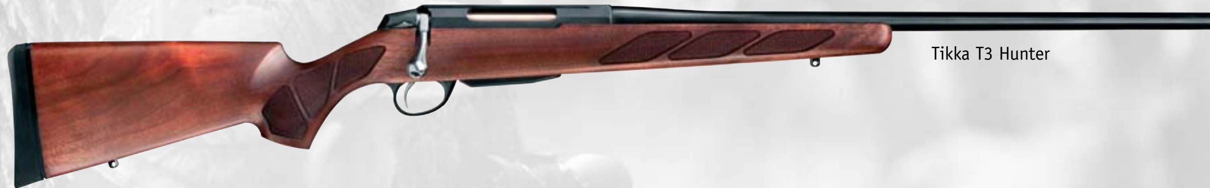
Tikka T3 Hunter