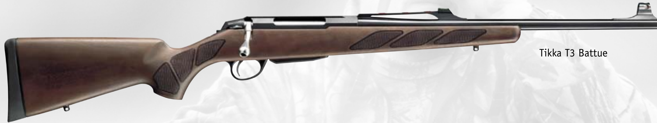
Tikka T3 Battue