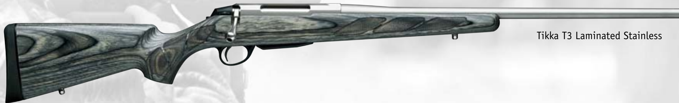
Tikka T3 Laminated Stainless

The Tikka T3 Hunter is for the hunter looking for top performance and innovation, but who prefers a classic style and feel. The high-grain walnut stock is selected and shaped by Sako master gunsmiths. The T3 Hunter offers an extensive caliber selection for hunting and sport shooting. An "old-world" platform based on modern thinking, taking you to a new level in accuracy, reliability ...and shooting enjoyment.