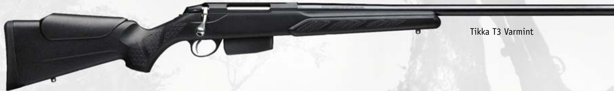
Tikka T3 Varmint