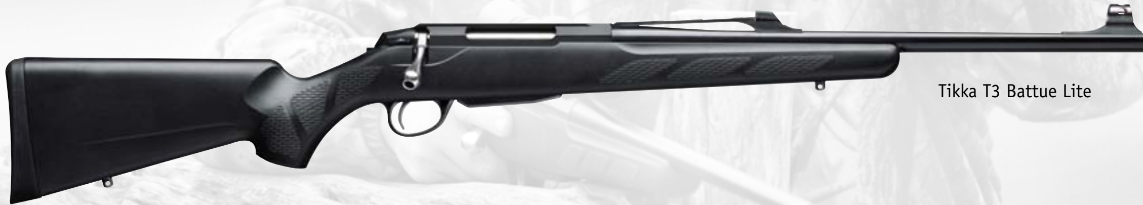
Tikka T3 Battue Lite

These lightning-fast rifles are built for driven hunts where most shots are taken at running game over relatively short distances. These remarkably handy rifles are also the top choice for a hunter who trek and hunt in heavy cover.