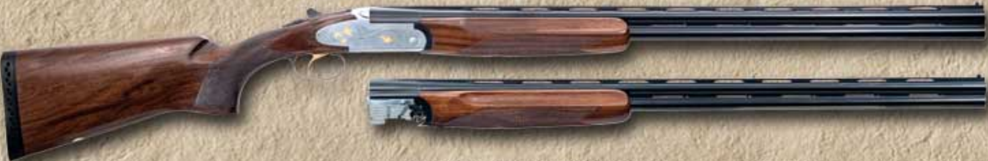
LX692GCSK-28/410 Competition Skeet/Sporting