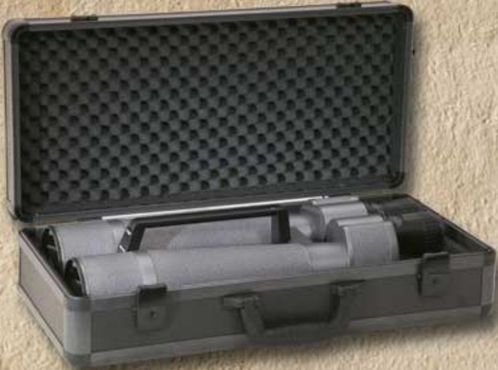
ASPECTUM HIGH-POWER BINOCULARS (Metal carrying case also available separately)