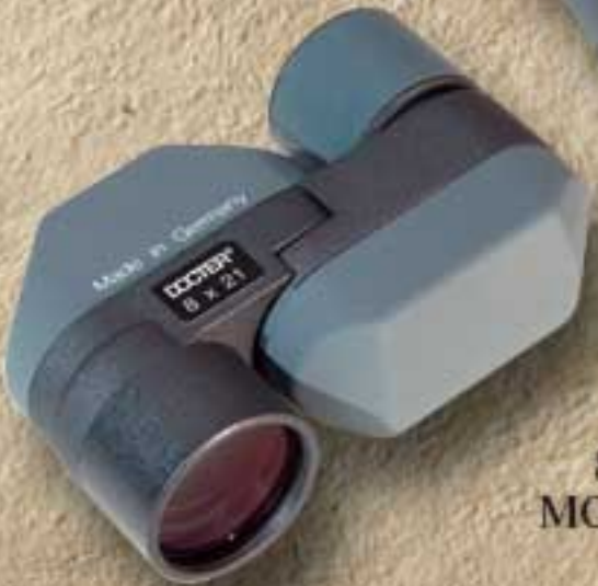
8 • 21mm MONOCULAR