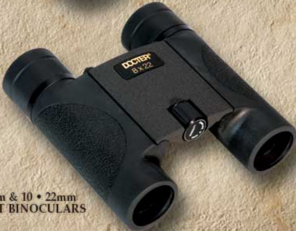
8 • 22mm & 10 • 22mm COMPACT BINOCULARS