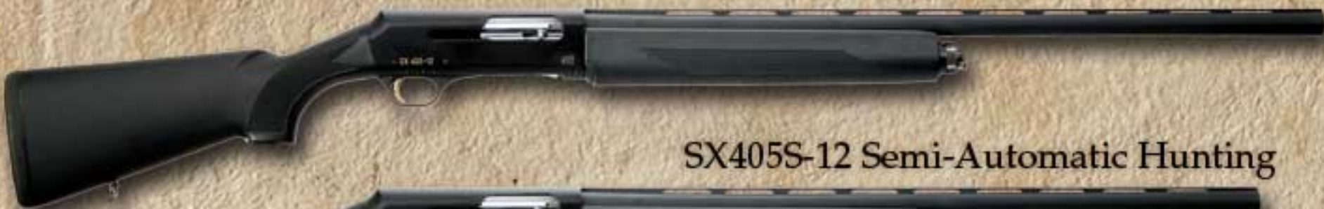
SX405S-12 Semi-Automatic Hunting