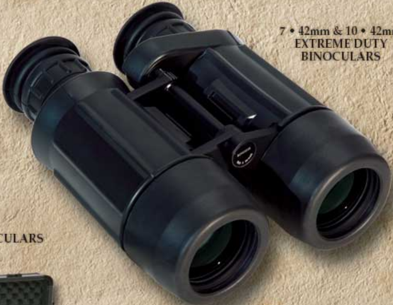
7 • 42mm & 10 • 42mm EXTREME DUTY BINOCULARS