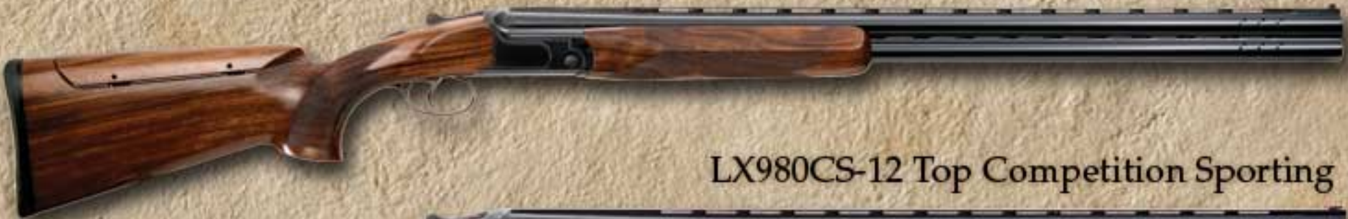
LX980CS-12 Top Competition Sporting