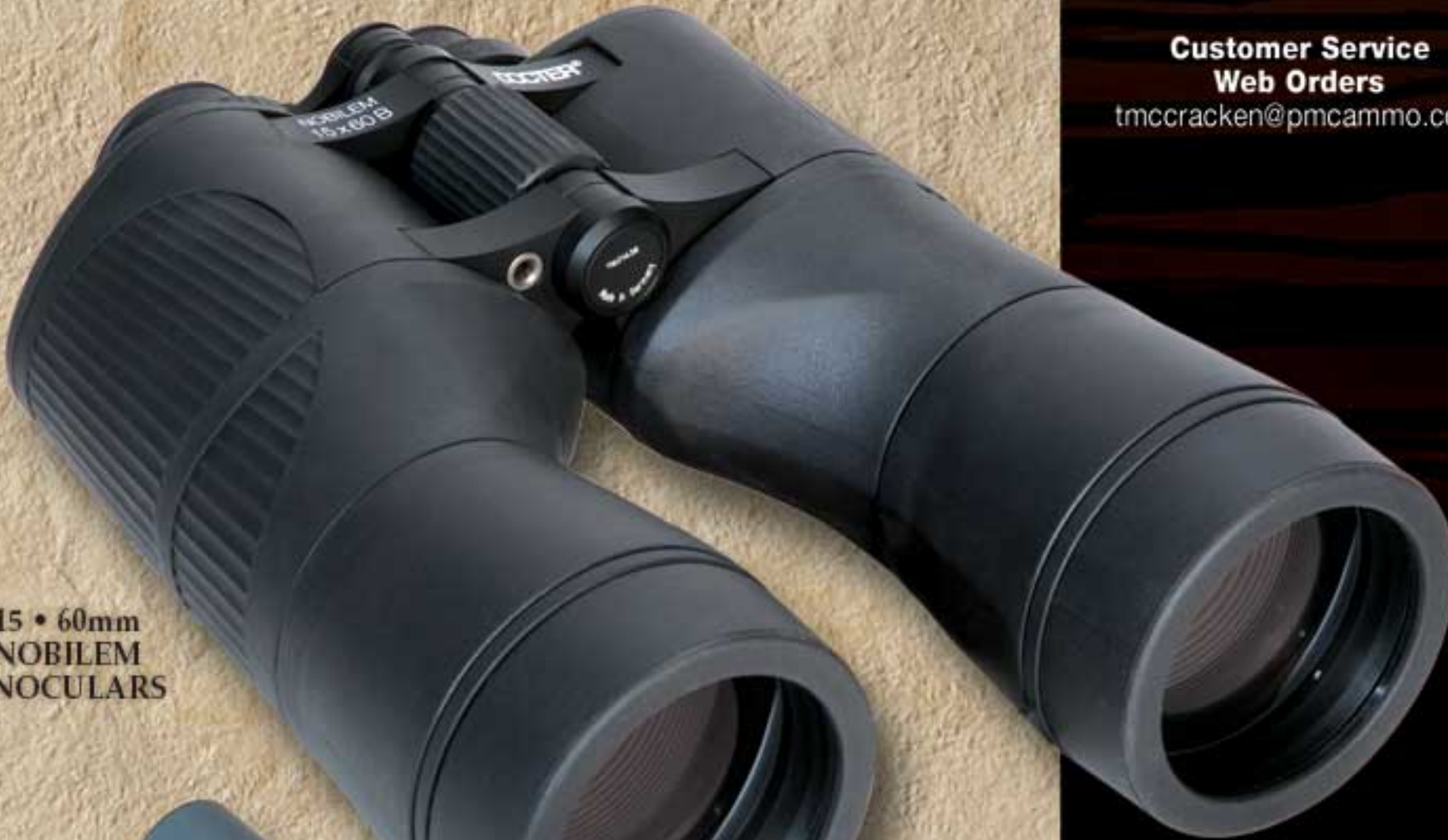
15 • 60mm NOBILEM BINOCULARS