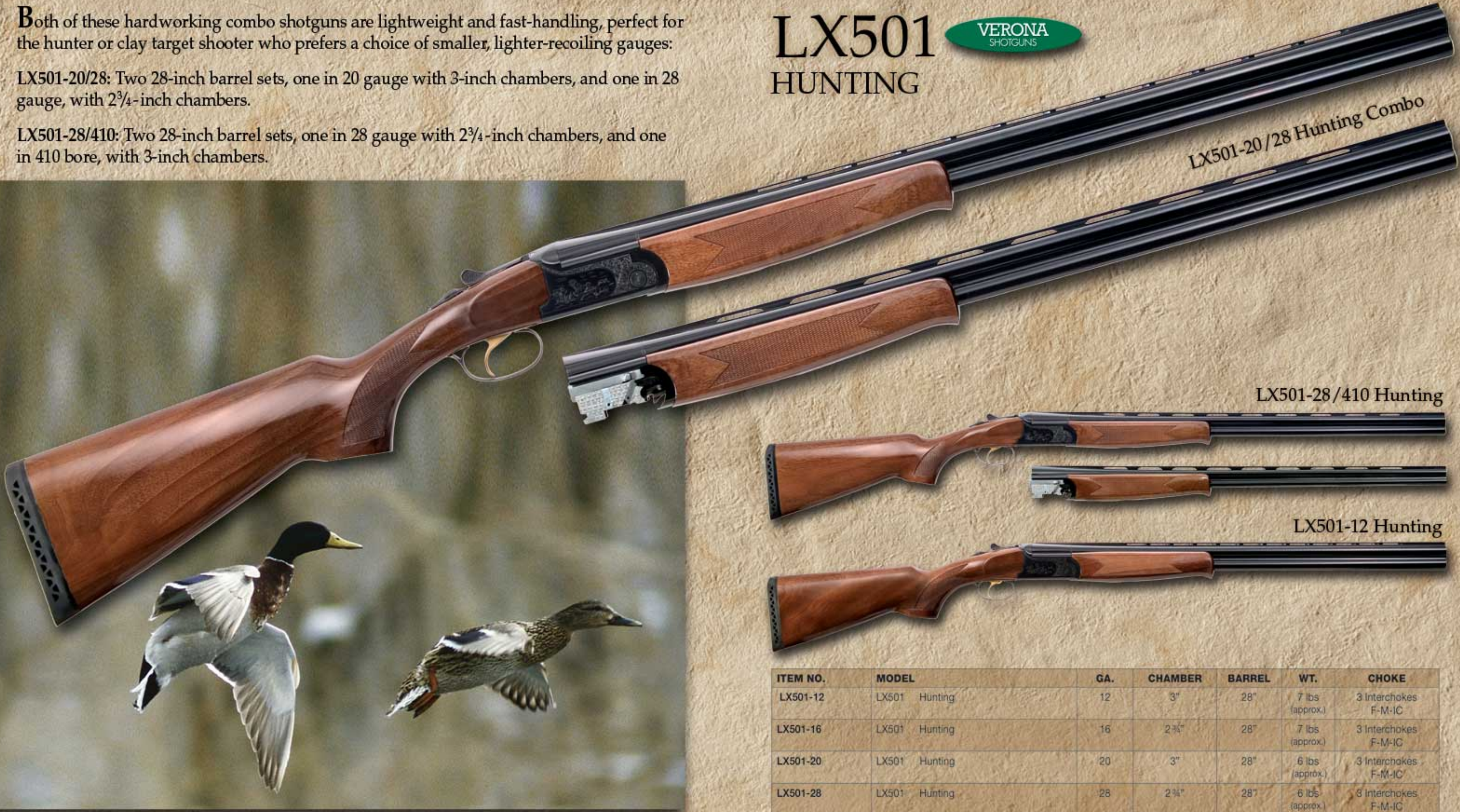
LX501-20/28 Hunting Combo