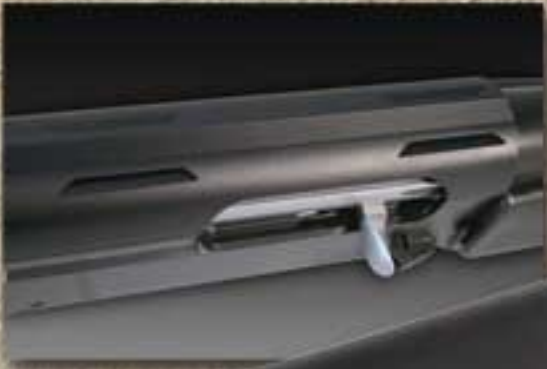
Built-in sight mounts on slug gun and combo

Four models of the SX405 are offered with appropriate camouflage designs for specific hunting purposes, and there's a new combination set (not camouflaged) that offers you the opportunity to switch from smoothbore to fully rifled slug barrel, depending on hunting purpose.