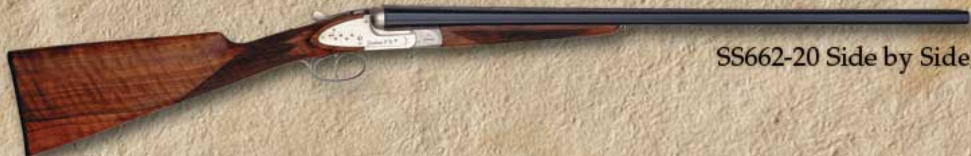
SS662-20 Side by Side

Each model is available in 20 & 28 gauge and features a Purdy Triple lock system. The hand engraving is in a classic motif and the stock and forend is hand-cut checkered in select oil finished English walnut.