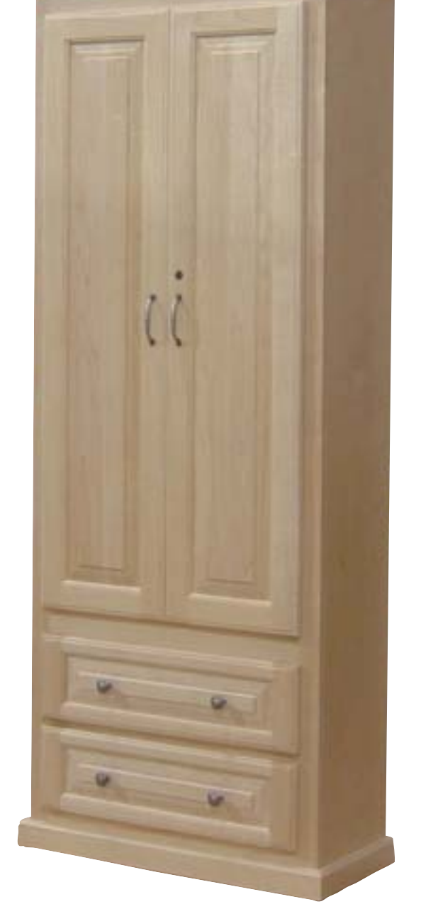
Maple – MDSWDR 6 or 8 Gun Cabinet