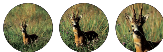
15 x 30 x 45 x

Many years of experience have shown that the magnification range between 15x and 45x is frequently used by professional guides and hunters.