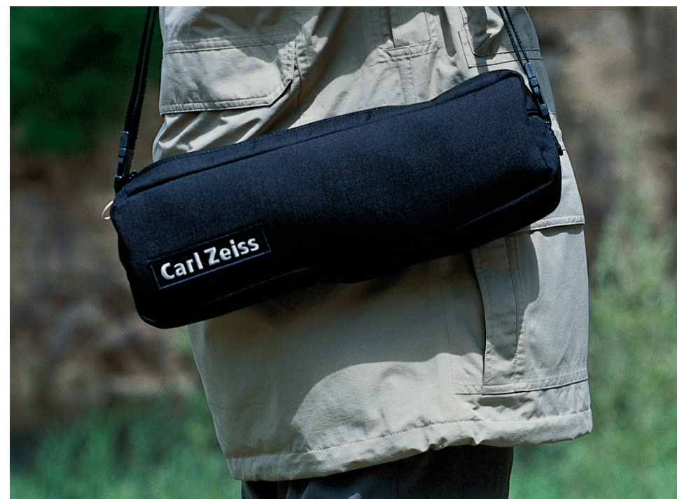
The functional bag made of robust Cordura material is the perfect container for transporting your scope.

The Zeiss Diascope Spotting Scopes at a glance.