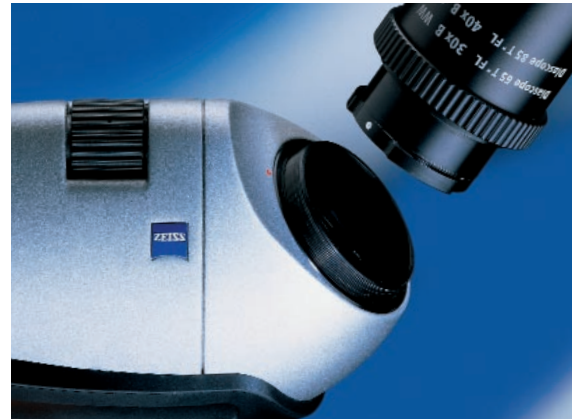
The practical and secure bayonet connection allows eyepiece change in a matter of seconds.

The new Zeiss Diascope 85 T* FL is in a class all its own in every respect. With its excellent weight/performance ratio — it tips the scales at just under 3.20 pounds — and a length of only 13.58 inches, it will certainly be no hindrance to you while out trekking. Like all Diascope models, it features a dual