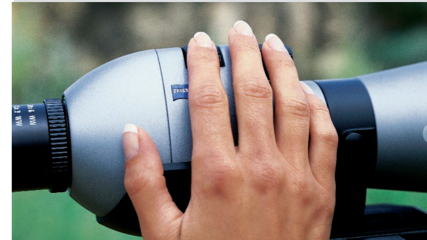
The Zeiss Diascope for straight viewing. The focusing system with two wheels for coarse and fine focusing is in an ergonomically correct position above the gripping area.

Take your pick: the Zeiss Diascope models for straight or angled viewing are suitable for practically any viewing purpose, whether from your bench or through a blind against a tree.