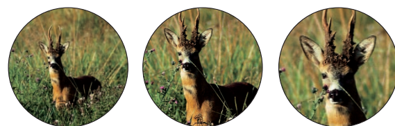
20 x 40 x 60 x

For the outstanding recognition of even the finest detail at very large distances, the Diascope 85 T* FL models together with the Vario eyepiece are the ideal solution.