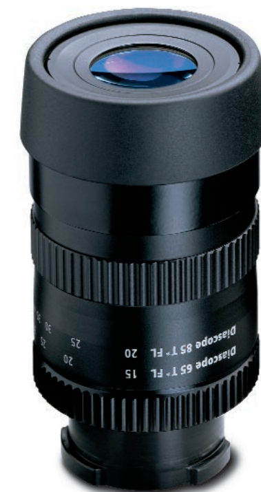
In conjunction with the Diascope 85 T* FL, the Vario eyepiece allows magnifications of up to 60x.