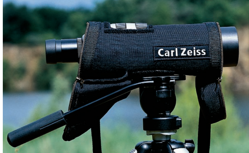
Zeiss spotting scope in its protective jacket.