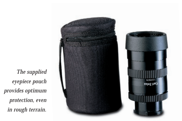
The supplied eyepiece pouch provides optimum protection, even in rough terrain.

of the exit pupil, and therefore also the full field of view for spectacle wearers, remain unchanged. The eyepieces feature a bayonet mount with a safety catch for rapid change — even in rough terrain.