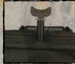
RETRACTABLE GUN REST