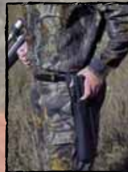
HANDY BELT POUCH