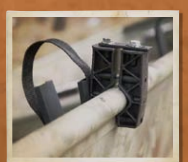
ALWAYS UNLOAD YOUR Gun Before Using Any Gun Rack

Shooters Ridge Gun Racks provide a safe, secure and convenient place for your gun to rest, no matter what your mode of transportation. Featuring special racks for boats, trucks and ATVs, these lightweight, easy-touse products provide a worry-free place to stow firearms.