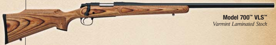
Model 700™ VLS™ Varmint Laminated Stock