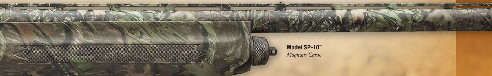
Model SP-10™ Magnum Camo