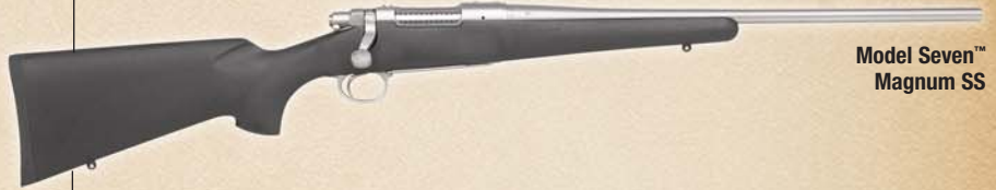
Model Seven™ Magnum SS