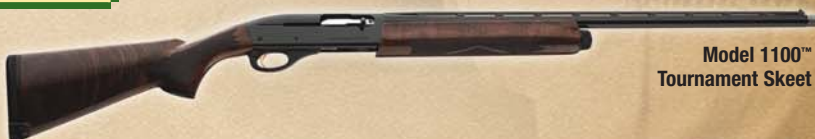
Model 1100™ Tournament Skeet