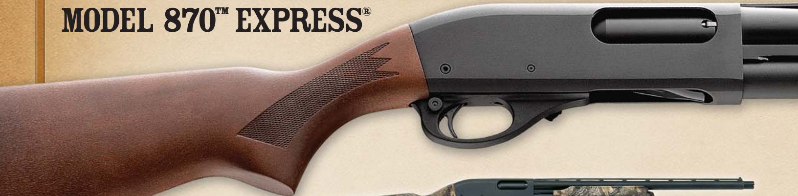
Model 870™ Express® Turkey Camo