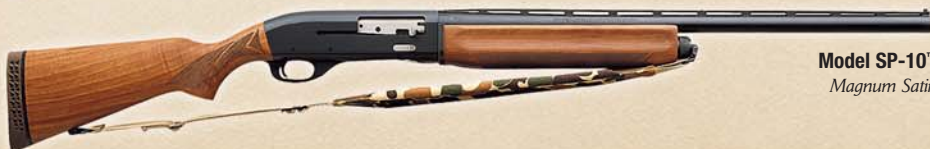
Model SP-10™ Magnum Satin