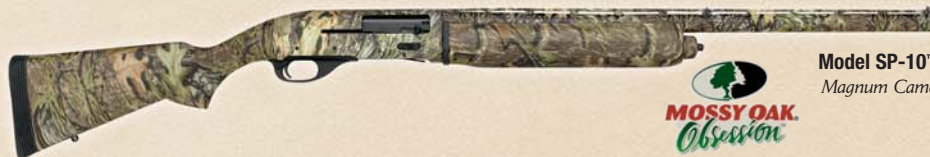
Model SP-10™ Magnum Camo

Available this year in Mossy Oak® Obsession®, the SP-10 comes with a 26" vent rib Rem™ Choke barrel with twin bead sights and interchangeable full and modified Rem™ Chokes. This year, the SP-10 is more comfortable to shoot than ever thanks to the addition of a R3® recoil pad with Limbsaver® patented technology.