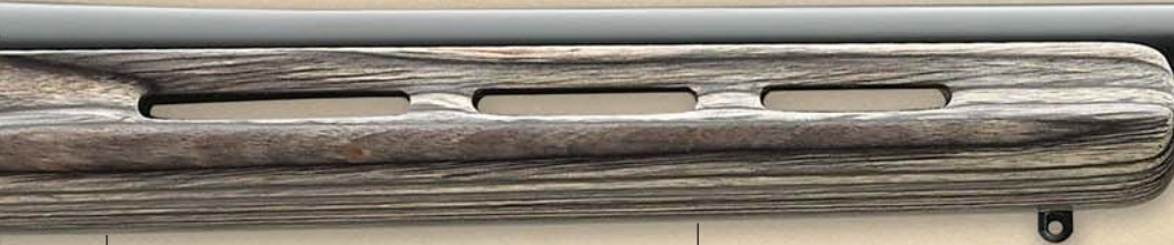
Model XR-100™ Rangemaster®