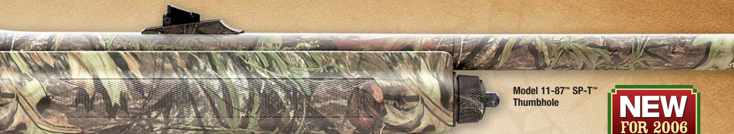
Model 11-87™ SP-T™ Thumbhole