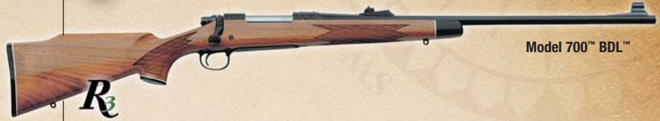
Model 700™ BDL™