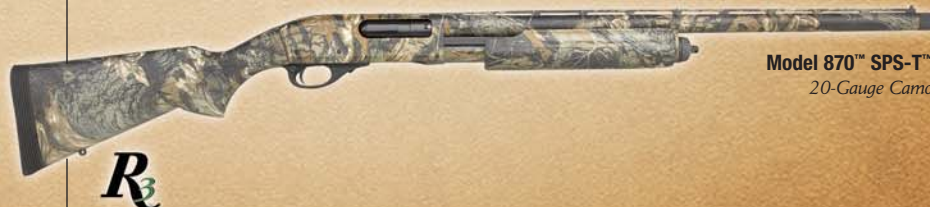
Model 870™ SPS-T™ 20-Gauge Camo