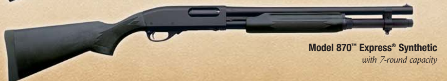
Model 870™ Express® Synthetic with 7-round capacity