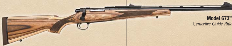
Model 673™ Centerfire Guide Rifle

The Model 673™ owes its striking good looks to a weather-resistant laminated stock of alternating dark and light veneers.