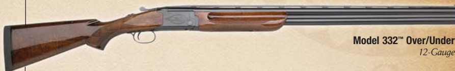
Model 332™ Over/Under 12-Gauge