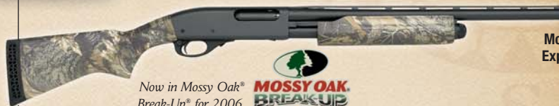
Model 870™ Express® Jr.