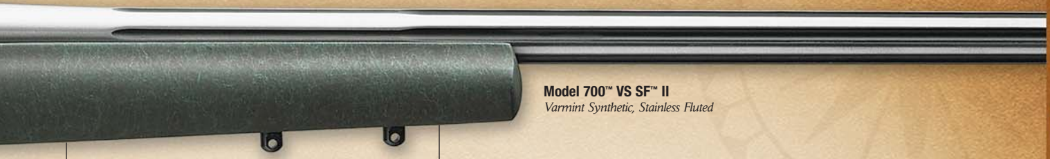
Model 700™ VS SF™ II Varmint Synthetic, Stainless Fluted