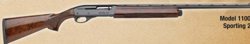
Model 1100™ Sporting 28

Model 1100™ Competition features extra polishing and nickel-Teflon® finish on internal parts.