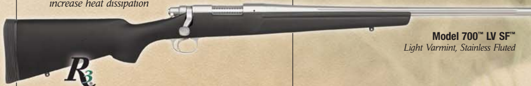
Model 700™ LV SF™ Light Varmint, Stainless Fluted