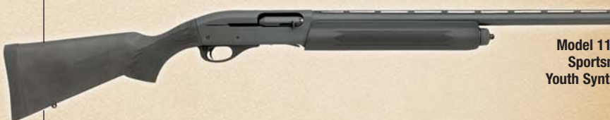
Model 11-87™ Sportsman® Youth Synthetic