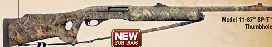
Model 11-87™ SP-T™ Thumbhole