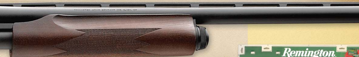
Model 870™ Express®

Superior design and inherent strength of 870™ receiver easily accommodates the power and longer length of 3 1/2" shells