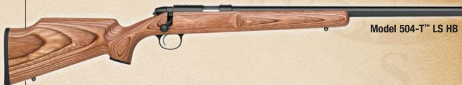
Model 504-T™ LS HB