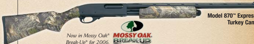
Model 870™ Express® Turkey Camo