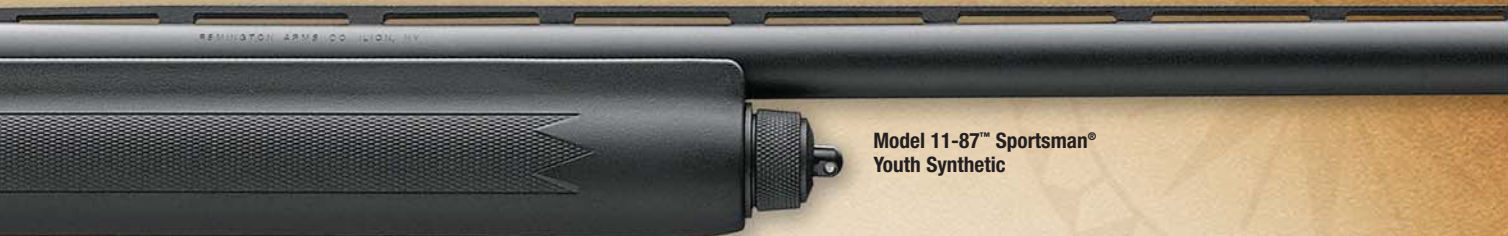
Model 11-87™ Sportsman® Youth Synthetic