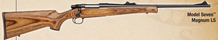
Model Seven™ Magnum LS