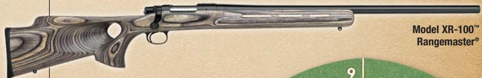
Model XR-100™ Rangemaster®