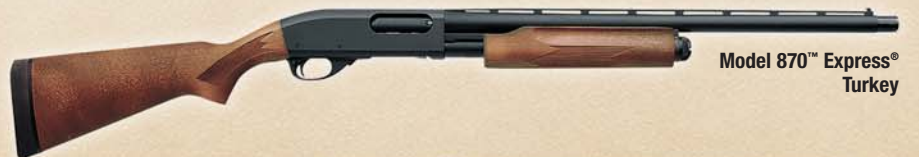
Model 870™ Express® Turkey