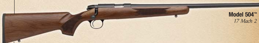
Model 504™ 17 Mach 2