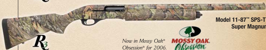
Model 11-87™ SPS-T™ Super Magnum