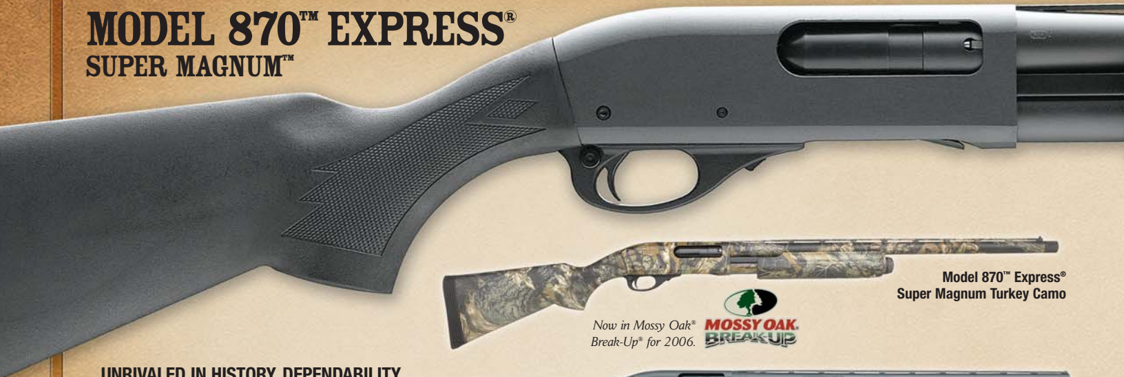
Model 870™ Express® Super Magnum Turkey Camo