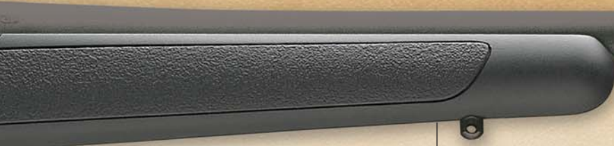
Model 700™ SPS™