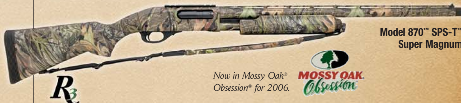
Model 870™ SPS-T™ Super Magnum