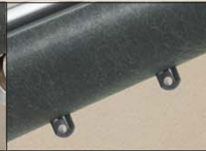
Bi-pod and Sling Swivel Studs