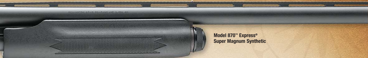
Model 870™ Express® Super Magnum Synthetic