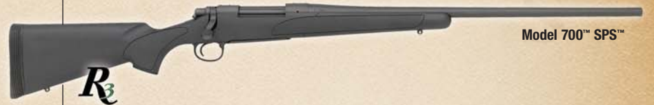
Model 700™ SPS™