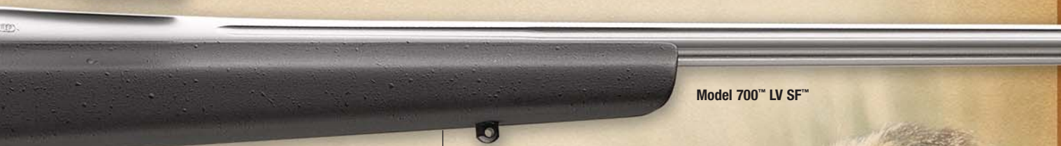
Model 700™ LV SF™