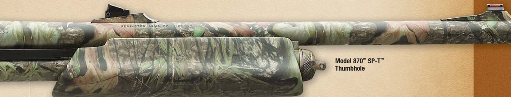
Model 870™ SP-T™ Thumbhole