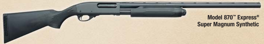
Model 870™ Express® Super Magnum Synthetic

a shotgun that's unrivaled in versatility. No other pump gun even comes close. You can go from shooting heavy 3 ½" loads at high-passing waterfowl to shooting light 2 ¾" loads at fast-darting doves without a hitch. And it does it all with the same action stroke, balance and feel of our original Model 870™ (the most popular pump gun in history). Finally, we can't forget to mention what may be the most appealing thing about the Express® Super Magnum®: It comes at a very affordable price. Many workhorse models are available, including stock choices of flat-finished hardwood, durable black synthetic or popular camo finishes.