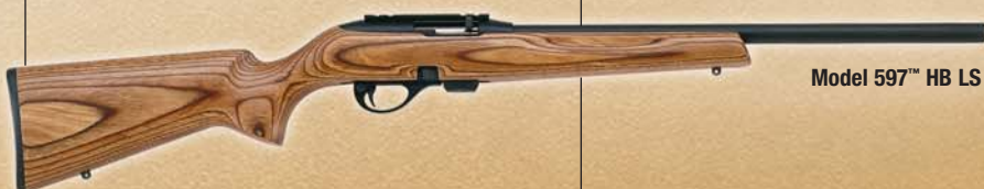
Model 597™ HB LS