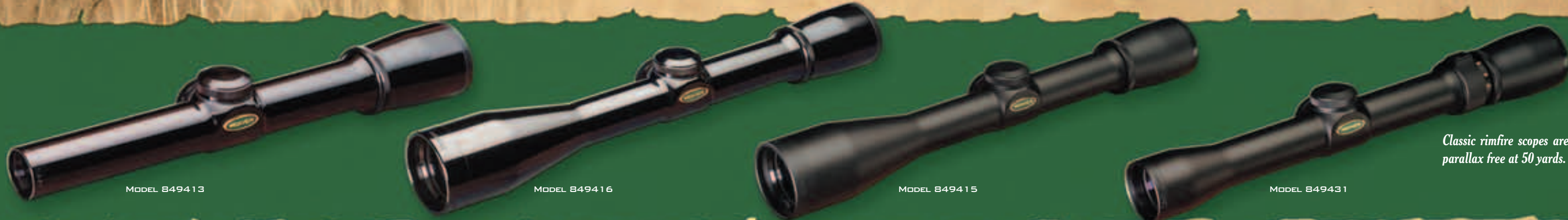
Classic rimfire scopes are set parallax free at 50 yards.