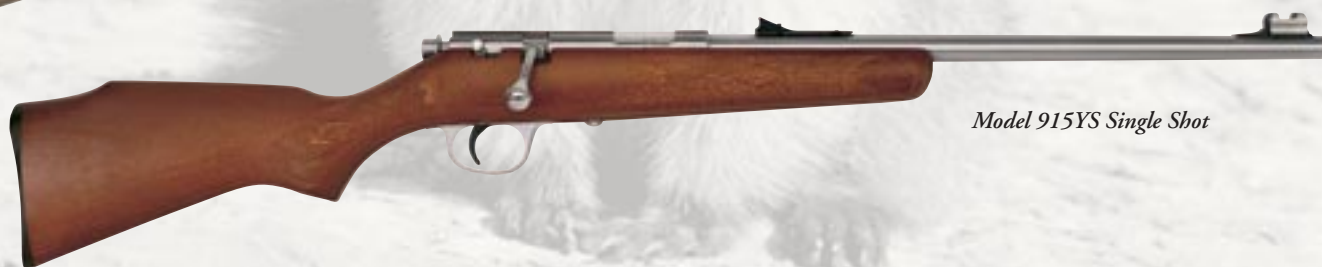
Model 915YS Single Shot