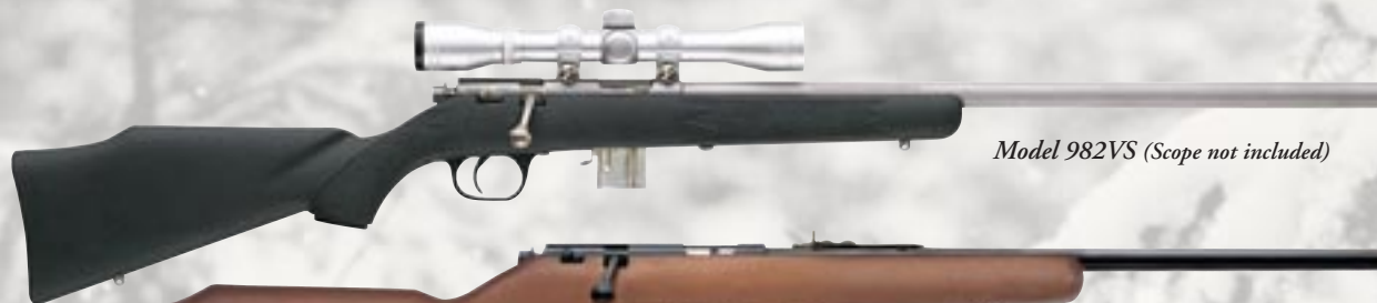
Model 982VS (Scope not included)

*Scope Mounting Bases are available for Marlin bolt action rimfire rifles with drilled and tapped receivers. Please refer to the back cover of this catalog.