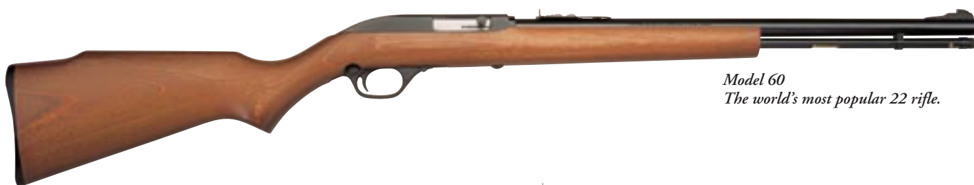
Model 60 The world's most popular 22 rifle.

Model 60SB America's favorite self-loading 22 rifle also comes in weather-proof stainless steel, with a walnut finished laminated hardwood stock. The tubular magazine holds 14 Long Rifle cartridges. The adjustable semi-buckhorn rear sight is complemented by a ramp front sight with high-visibility post and cutaway Wide-Scan™ hood.