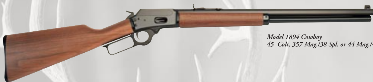
Model 1894 Cowboy 45 Colt, 357 Mag./38 Spl. or 44 Mag./44 Spl.

*Consult Owner's Manual for details on ammunition use.