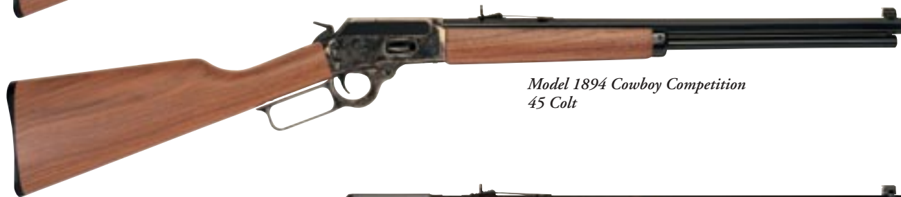
Model 1894 Cowboy Competition 45 Colt