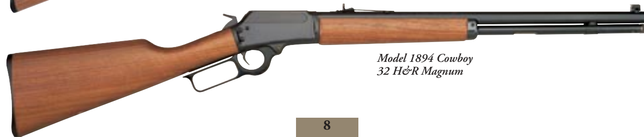
Model 1894 Cowboy 32 H&R Magnum