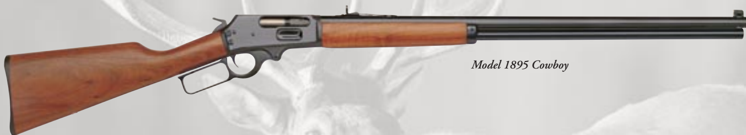
Model 1895 Cowboy