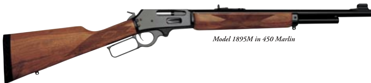
Model 1895M in 450 Marlin

Model 444 A big bore favorite that combines the power of the big 444 Marlin cartridge—which generates nearly 1½ tons of muzzle energy—with the quick and super-smooth Marlin lever action system. Its 22" barrel makes the 444 a real joy to handle, no matter what the conditions.