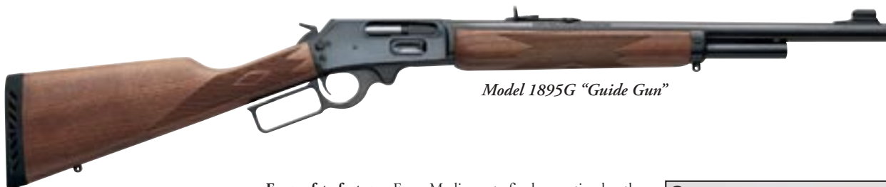
Model 1895G "Guide Gun"

Four safety features: Every Marlin centerfire lever action has these safety features: (1) Two-piece firing pin. The rear section of the pin drops out of alignment with the front until the locking bolt is fully engaged. (2) Trigger block. This device prevents the trigger from being pulled until the lever is closed. (3) Half cock hammer position. This is the traditional lever action hammer safety position. (4) Hammer block safety. When engaged, it prevents the hammer from striking the firing pin, even if the trigger is pulled.