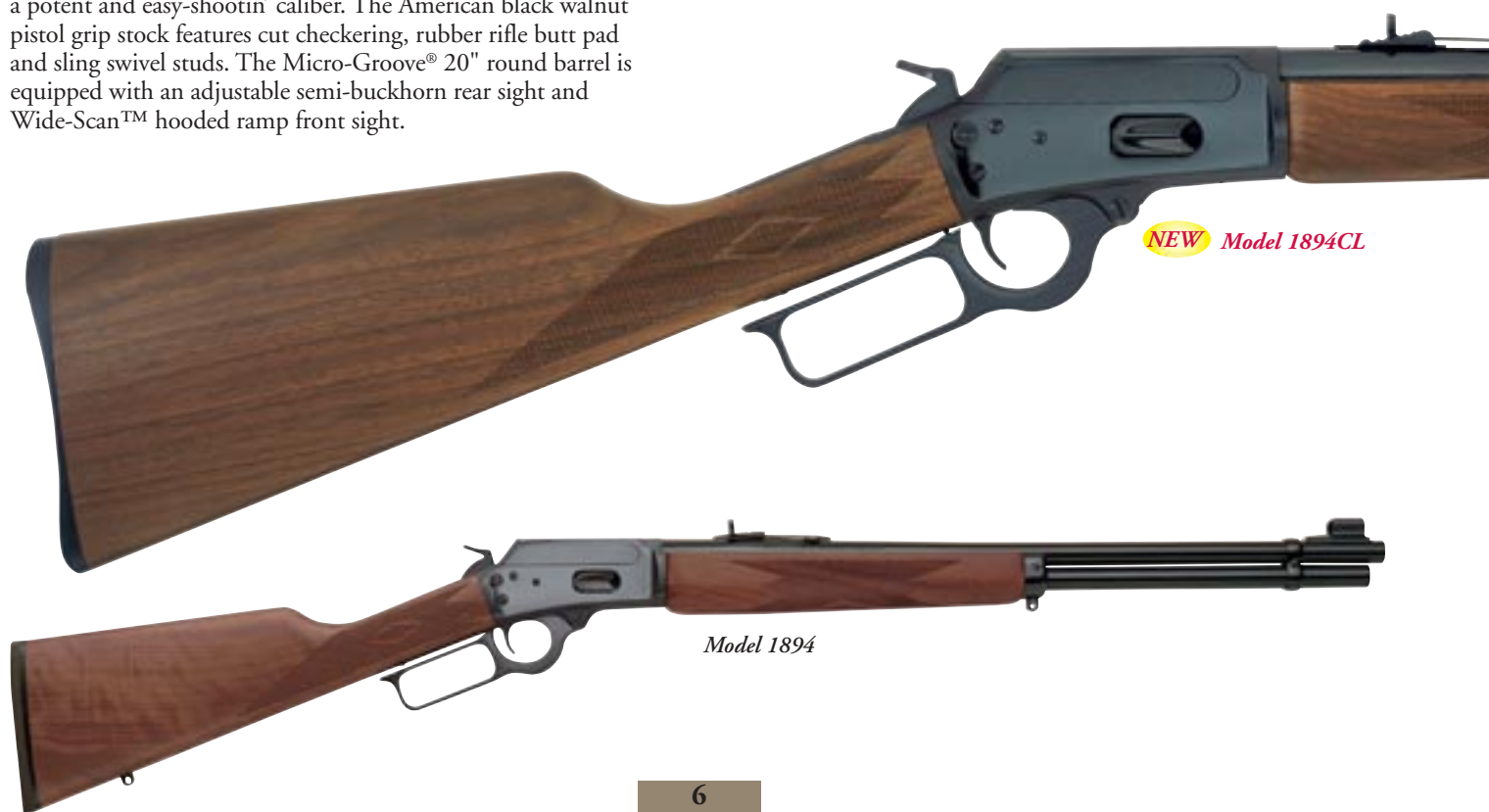
NEW Model 1894CL