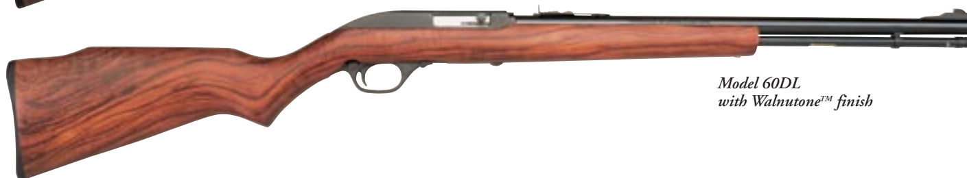
Model 60DL with Walnutone™ finish