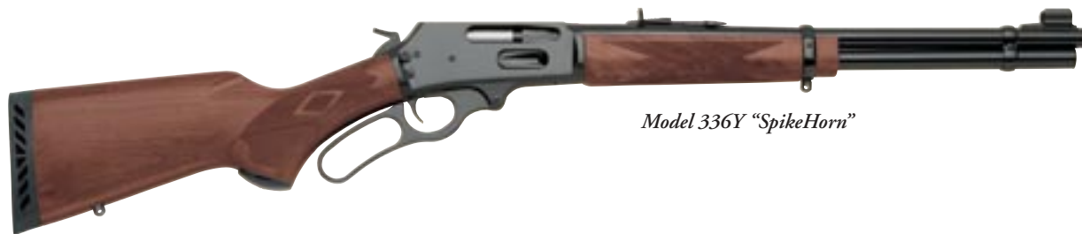
Model 336Y "SpikeHorn"

Model 336A A gutsy, no-frills 30/30 with classic styling, a 6-shot tubular magazine and 20" Micro-Groove® barrel, the 336A has a lot of the same features as the 336C, but at an even more attractive price. Its hardwood stock has cut checkering and swivel studs.