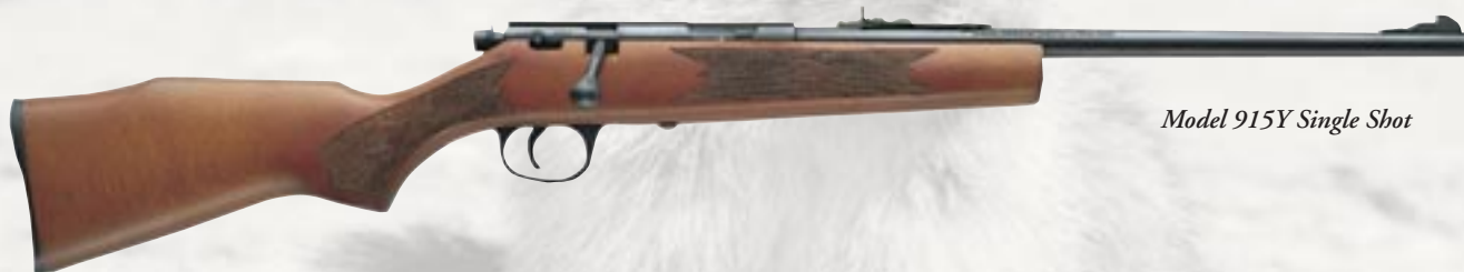
Model 915Y Single Shot