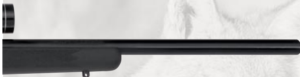
Model 7000 (Scope not included)