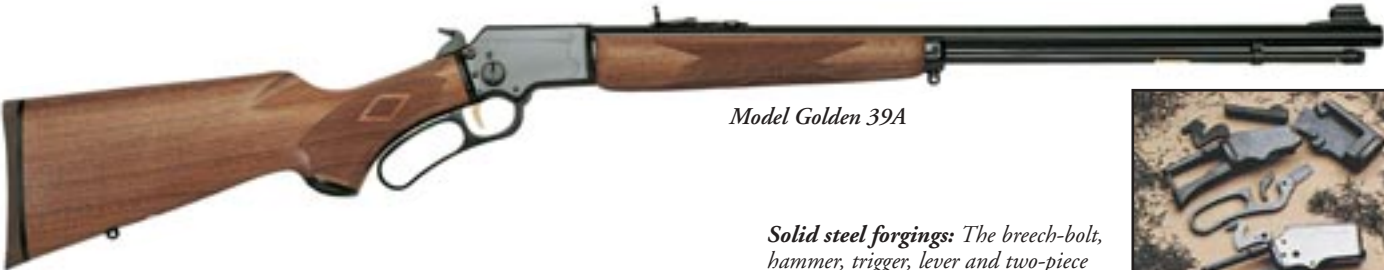
Model Golden 39A

The Model 39A also features a rebounding hammer, a hammer block safety, and it disassembles in seconds with only a coin. And the stock is crafted from genuine American black walnut and features fine cut-checkering. Thanks to Micro-Groove® rifling, a special process that produces less bullet distortion and a better gas seal, the 39A gives you the kind of accuracy most other 22's can't touch.