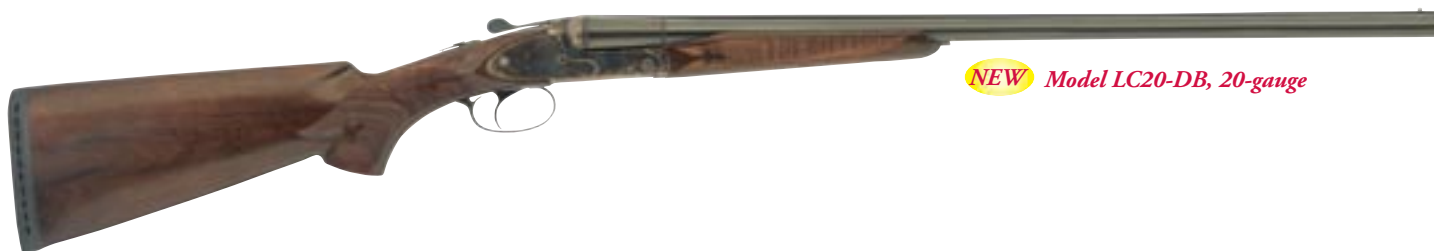
NEW Model LC20-DB, 20-gauge