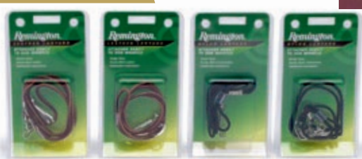
R1139 R1138 R1136 R1137

Available in Latigo leather or black nylon. Choice of a single snap or a double snap, which is great for a combo of training whistles, keys, animal call whistles, etc.