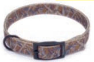
R2903 (Rem. Camo)

Our high quality, deluxe nylon is specially processed to prevent fraying and increase the strength of our nylon collars, harnesses and leads. They are carefully finished for comfort, appeal and durability.