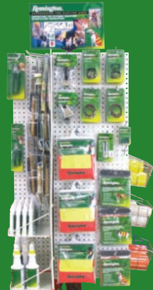
16" Nylon Display