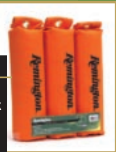
WHITE YELLOW BLACK/WHITE ORANGE

Also available, 2" x 9" and 3" x 12" canvas dummy 3 packs, in Natural and Orange; 2" x 11" and 3" x 12" vinyl dummy 3 and 6 packs, in White and Orange.