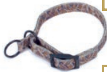
R2907 (Rem. Camo)