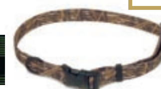
R6901 (Mossy Oak Camo)