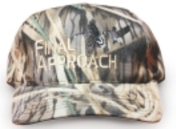
Mossy Oak<sup>®</sup> Shadow Grass™