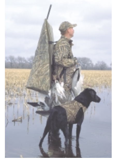
The backpack carrying style gives you hands-free mobility. Effective for all types of hunting.